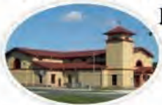
Church of the Assumption in Galloway