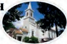
Saint Nicholas Church in Egg Harbor City

Parish Day at the Egg Harbor City Lake Saturday, June 15 th , 2024