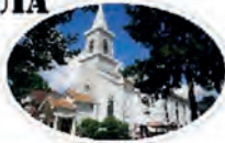
Saint Nicholas Church in Egg Harbor City

Día de la Parroquia en el Lago de Egg Harbor City sábado, 15 de junio, 2023