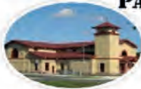
Church of the Assumption in Galloway