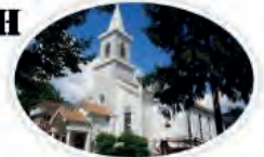
Saint Nicholas Church in Egg Harbor City