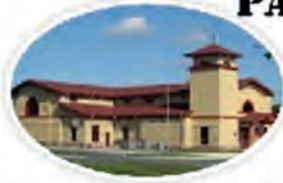
Church of the Assumption in Galloway