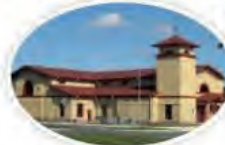
Church of the Assumption in Galloway