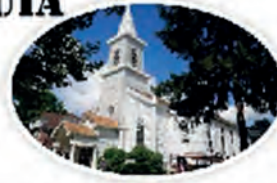
Saint Nicholas Church in Egg Harbor City

Día de la Parroquia en el Lago de Egg Harbor City