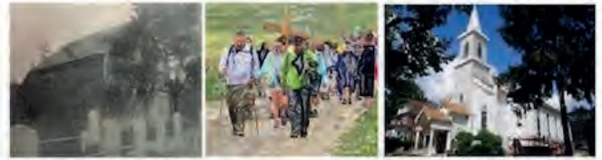
St. Mary's of the Tower, ubicada como el cementerio católico más antiguo del sur de NJ (1827)

www.kofc.org/joinus o llame a nuestros representantes mencionados anteriormente.