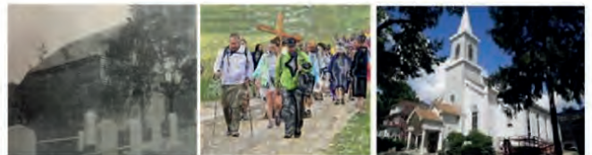
Saint Mary's of the Pines known as the oldest Catholic cemetery in southern NJ (1827)